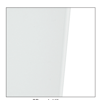
OP opal diffusor